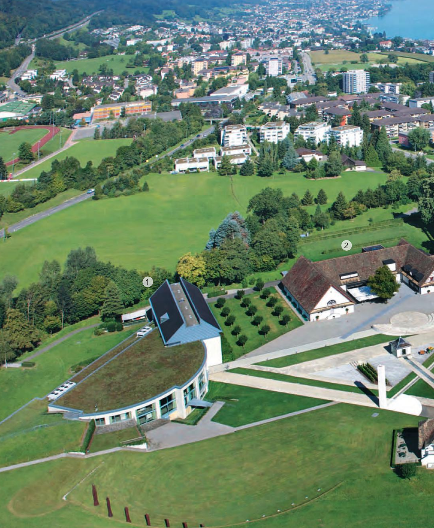
1 Seminargebäude, 2 Reitgebäude, 3 Taubenhaus, 4 Landhaus